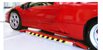
Special color extra charge