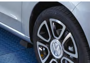
Accessories: truncated pyramid pad