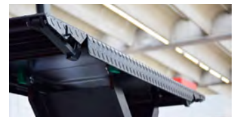
Flaps to increase the length of the ramps, easy to lock and unlock with one hand